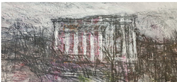
A Potteries Parthenon: The Bird Cote by Arthur Berry, by kind permission of the Estate.