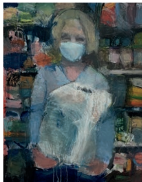
Food Bank by Ian Mood