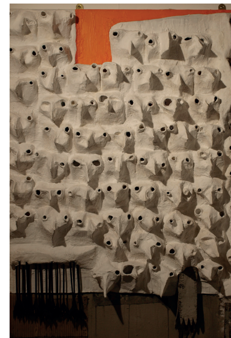
The Wicked Land Poem by Semaan Khawam

Keele University's Art Collection has always been committed to engagement. A good proportion of its art collection is shared on ArtUK, an online platform for UK public collections. ArtsKeele regularly organises exhibitions, displays, and events, both on campus and in external venues, to share its treasures with a wider audience, forging new relationships and raising the profile of local emerging and established artists. In 2024, The Mill Gates by L.S Lowry will go on display at the Bowes Museum as part of the exhibition Kith and Kinship: Cornish and Lowry.